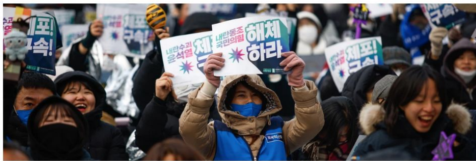
Thousands of members of the Korean Confederation of Trade Unions, predominantly young people in their 20s and 30s, stage a protest near President Yoon Suk Yeol's official residence in Hannam-dong, calling for his arrest in Seoul, South Korea, on January 6, 2025.