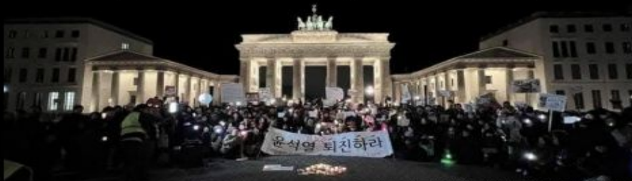
사진: 2024년 12월 13일 베를린 브란덴부르크 문 앞 3차 시국집회, 크레아티브피